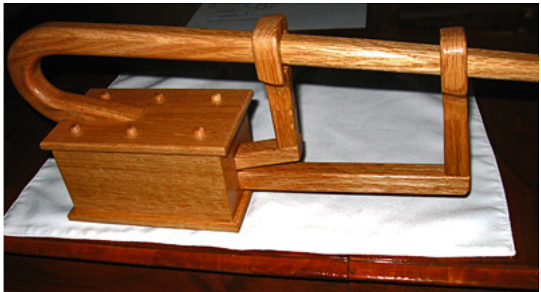
A Complicated Roman Lock Design with Fixed Horizontal Shackle (Made of Iron, this must have weighed a ton!)

Note that by inserting the hollow ended key into the lock body and rotating it upward and pushing it forward compresses the leaf springs on the two tapered tangs, allowing the double eyed latching assembly to be withdrawn from the body, unlocking the device. [Ed. Note: Is there a harder way to do this?]