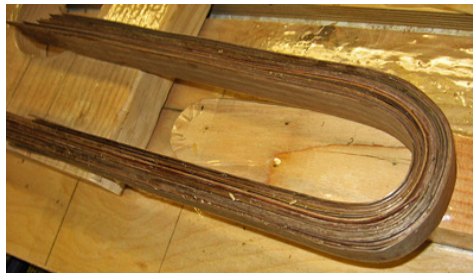
Glued Up Veneer Shackle Blank