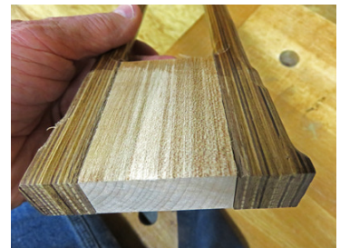
End View of Veneer Glueup

After drying, the veneer shackle blank was milled with a roundover bit in his router table in four passes to form a quarter round radius on each internal and external corner, ultimately producing the desired circular cross section.