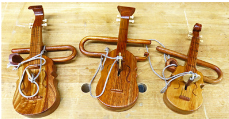
Violin Lock Collection