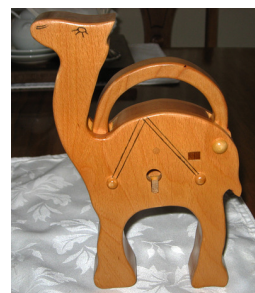
Egyptian Animal Locks