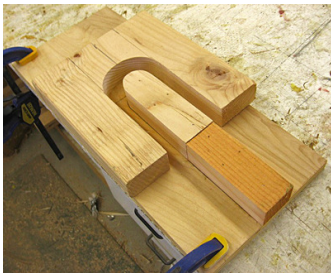
Shackle Forming/Clamping Jig

So he developed some interesting alternative configurations to eliminate the end grain breakage problem. First, he built a forming/clamping jig into which he installed multiple strips of hardwood veneer, with the grain aligned along the length of the shackle. Glue was applied to the veneer strips prior to installation in the jig and the layup was clamped both transversely and longitudinally to form the shape and compact the layers of veneer.